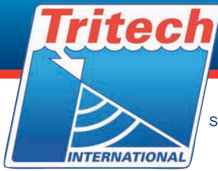
Single port housing