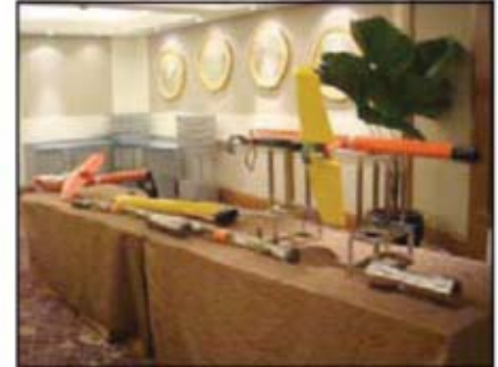
ION Towed Streamer Technology

Surveys must be safe and efficient to cost-effectively deliver high resolution data required to image deeper, more complex targets. The portfolio of ION marine technologies is designed to work together as a single intelligent system to improve the safety, quality, and productivity of operations. Cutting-edge products were displayed that enable customers to proactively position and optimize the spread while decreasing acquisition complexity, cycle time, and cost in the most challenging surveys and conditions.