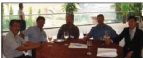
Attendees enjoy the cocktail reception

ION will continue closely collaborating with our customers to deliver marine acquisition technologies that meet today's complex survey requirements and address the exploration challenges of tomorrow.