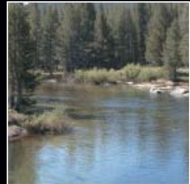
River Discharge and Flow