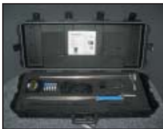
Rugged case provided with optional top-setting rod