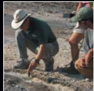
Spot Current Sampling