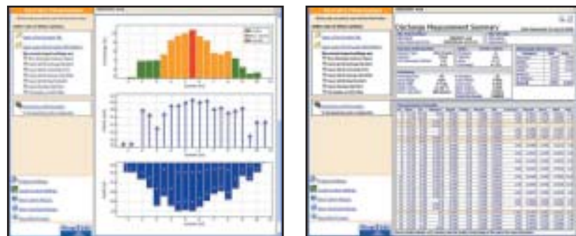
Example of FlowTracker discharge software and reports

The FlowTracker comes with user-friendly, data analysis software that helps you produce attractive, customizable and professional reports in minutes. FlowTracker software also supports several languages, making it an ideal solution for international applications.