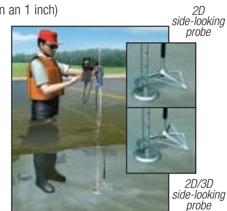
Example of typical stance and technique when using the FlowTracker