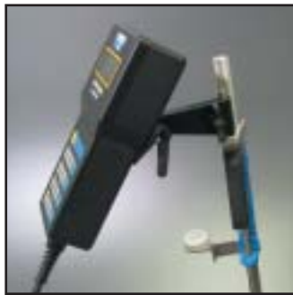
The SonTek Deluxe wading rod, featuring a sturdy grip and bubble level

No other wading discharge device on the market comes with more useful options and accessories, making the FlowTracker a complete, turn-key solution.