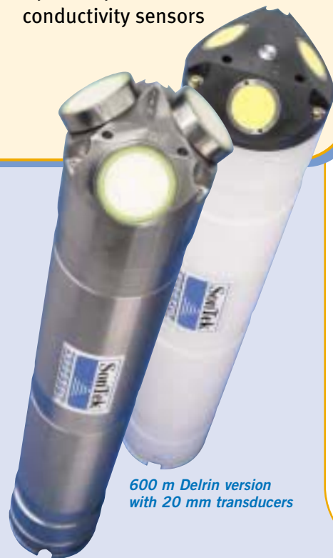
600 m Delrin version with 20 mm transducers