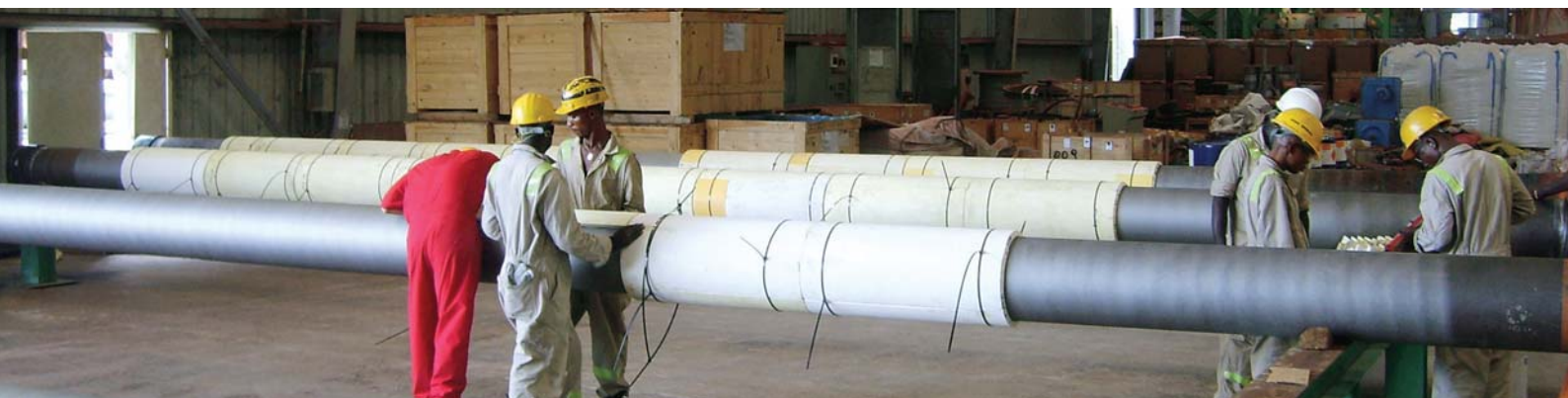
Nigeria, West Africa