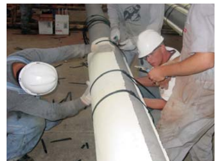
Temporary banding application