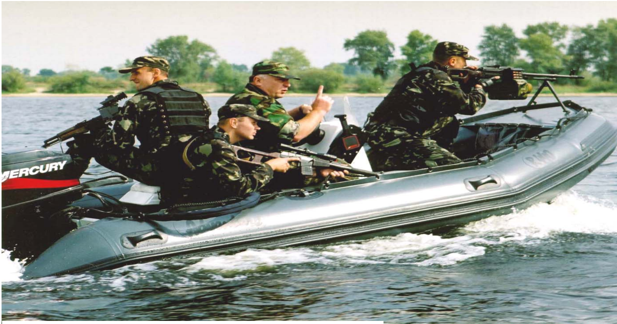
Picture shown above with optional centre control