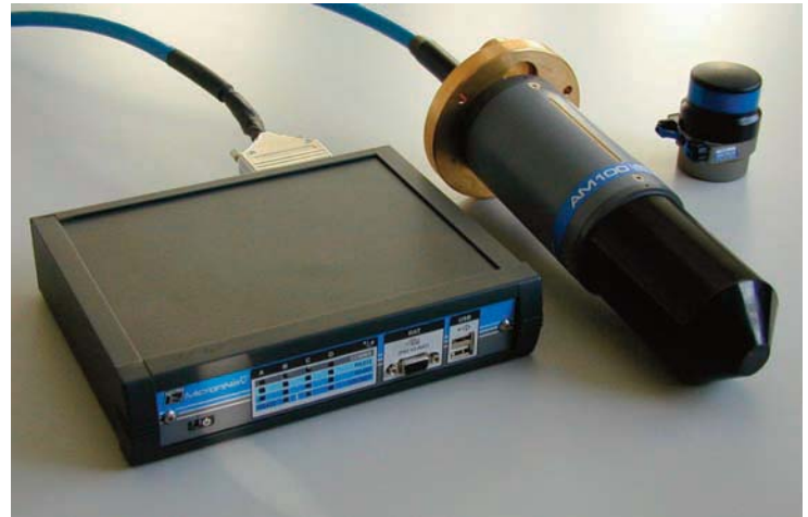
Picture of MicronNav100 Interface Unit, USBL Dunking Transducer and MicronNav subsea unit.

The MicronNav system is an innovative USBL positioning system designed for small vehicles. It has been primarily designed to be used in conjunction with the Tritech Micron/SeaSprite sonar and other Tritech Micro products. This concept will also be adapted and integrated into the Tritech SeaKing range of products in the future.