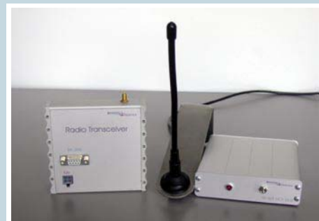
Above: Data transmission to PCMCIA-Data Logger or via Radio Module