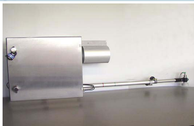
Mobile version of LOG_aLevel ® with 6 m sensor fixed at extendable telescope arm and reference sensor for sound velocity determination (back of housing)