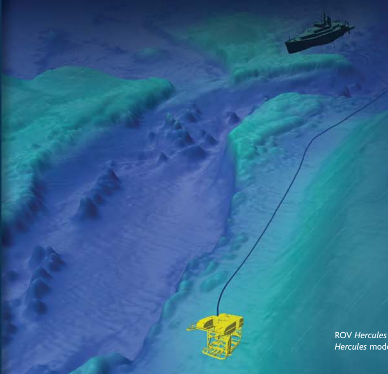
ROV Hercules exploring the West Flower Garden Bank, Gulf of Mexico, from mapping by USGS. Hercules model courtesy of the Institute for Exploration.

FM Viz4D moves users beyond static 2D representation and analysis to an intuitive and dynamic 4D environment. It combines quantitative tools with easy import of multiple types of data, giving you the ability to build integrated scenes, create high resolution images and movies, and export to standard GIS and CAD packages. FM Viz4D is truly more than " just a pretty picture " – it's a comprehensive visualization and interpretation environment.